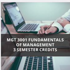
MGT 3001 FUNDAMENTALS OF MANAGEMENT 3 SEMESTER CREDITS

It is possible to be awarded credits from Spartan College for certifications earned through the Federal Aviation Administration (FAA). Please refer to the Transfer Credit Policy in the Tulsa Catalog for more information or speak with our campus representatives to find out more.