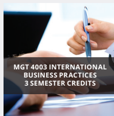
MGT 4003 INTERNATIONAL BUSINESS PRACTICES 3 SEMESTER CREDITS

An in-depth study of managerial practices needed for business in today's global marketplace. Subject areas include managerial theory and several special topics including a global perspective on management in the world economy. Case studies illustrating managerial problems and solutions are widely used.