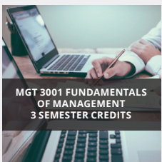
MGT 3001 FUNDAMENTALS OF MANAGEMENT 3 SEMESTER CREDITS

It is possible to be awarded credits from Spartan College for certifications earned through the Federal Aviation Administration (FAA). Please refer to the Transfer Credit Policy in the Tulsa Catalog for more information or speak with our campus representatives to find out more.