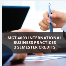
MGT 4003 INTERNATIONAL BUSINESS PRACTICES 3 SEMESTER CREDITS

An in-depth study of managerial practices needed for business in today's global marketplace. Subject areas include managerial theory and several special topics including a global perspective on management in the world economy. Case studies illustrating managerial problems and solutions are widely used.